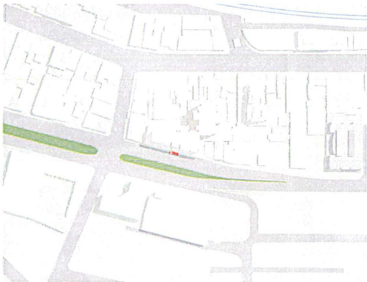
SHADOW DIAGRAM 22 DECEMBER NOON