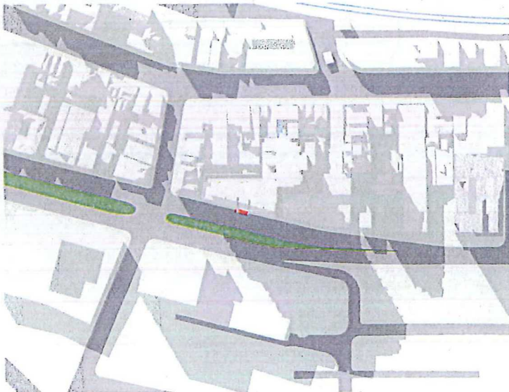
SHADOW DIAGRAM 22 JUNE 3 PM