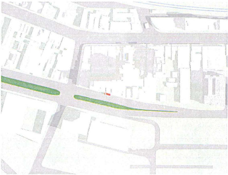
SHADOW DIAGRAM 22 DECEMBER 9 AM