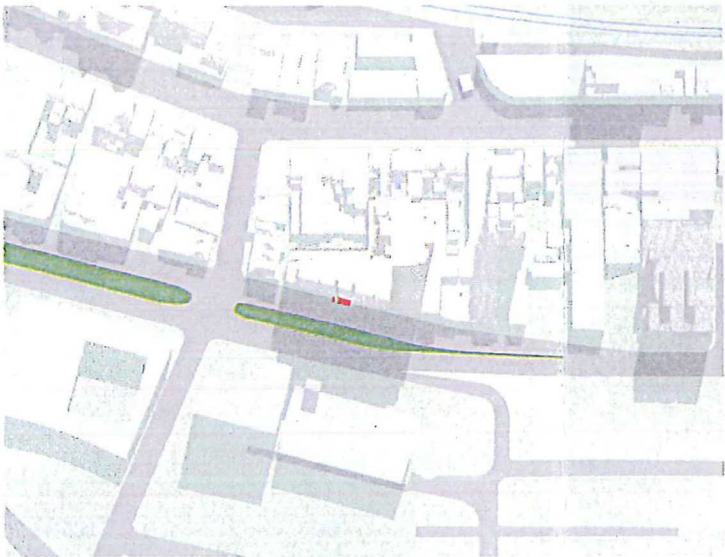
SHADOW DIAGRAM 22 JUNE NOON