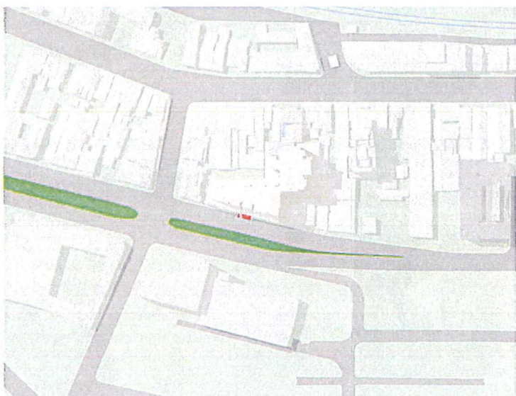
SHADOW DIAGRAM 22 DECEMBER 3PM